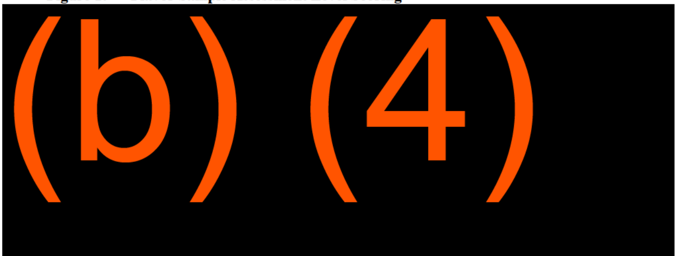
Figure 1: Flavor Sample Assessment Level Scoring

Figure 1 describes the approval procedure for new flavors.